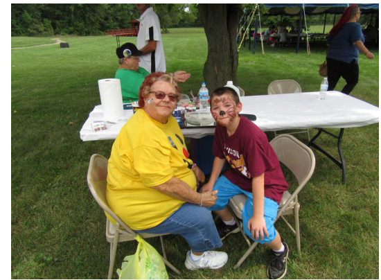
Face Painting by Le Dias Clowns