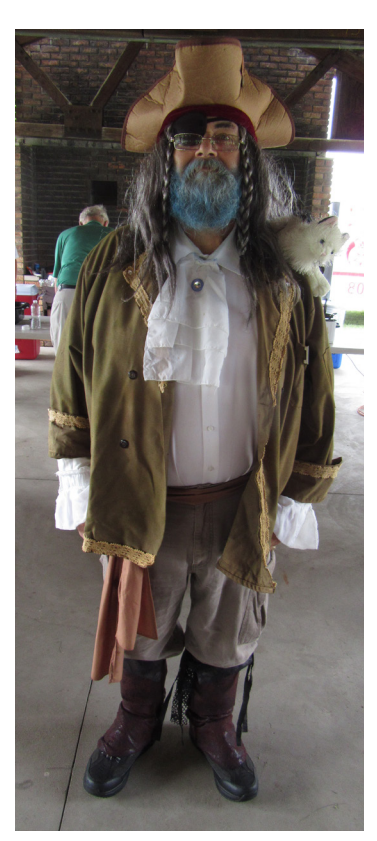
Shrine Clown "Blue Beard"