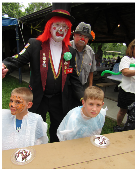
Annual Pie Eating Contest