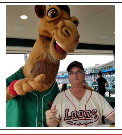
There's a potentate with rally camel