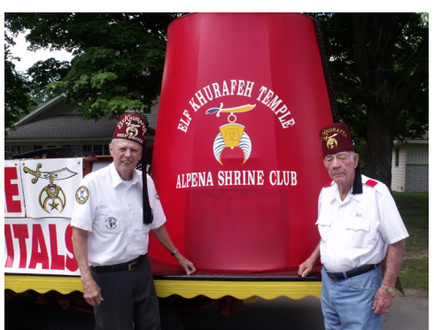
Alpena Shrine Club