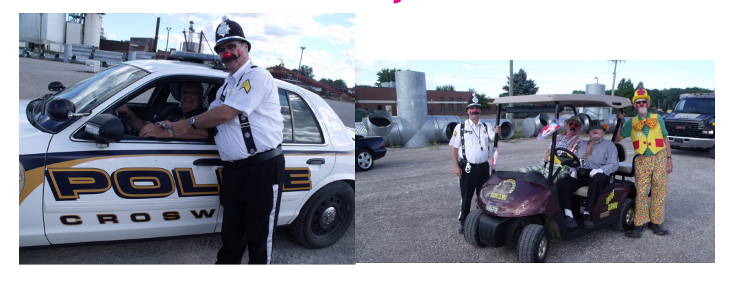
Sarge, Blooper, Frizy, and Shabby....The Clown Unit