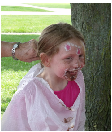
Pie Eating contest; great fun for the kids.