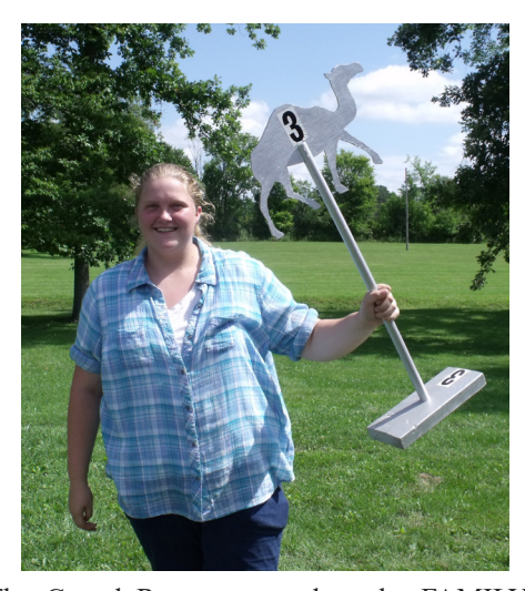
The Camel Races returned to the FAMILY PICNIC this year. It was not a huge success but the kids and adult participants had a good time. Maybe the Oriental Band will try again next year.