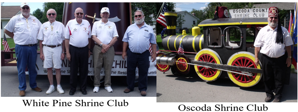
White Pine Shrine Club