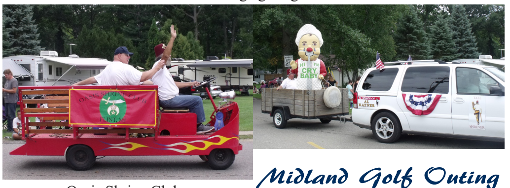
Oasis Shrine Club