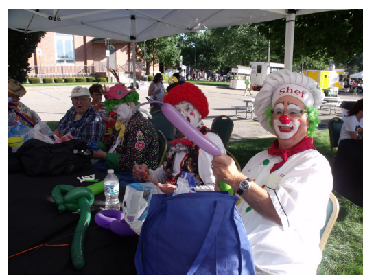
Rodeo, TKat and Nitro Twisting Balloons