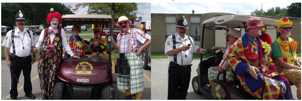
Clown Unit...Sarge giving Directions!