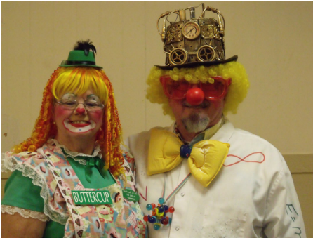
Having Fun Yet?

Everyone had a great time at the Shriner's Halloween Party. It was held at the Shriner's Hall in Saginaw, MI on October 28, 2018. If you missed it this year, be sure to attend next year.