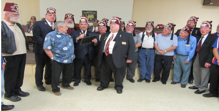
Oasis Shrine Club members were given the Potentate's Award for all the donations and contributions that they have done at Circus Park Facility during the 2018 year.