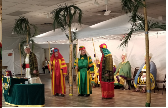
Our Ritualistic Cast at its best some of the New Candidates participate in the Ceremony while others look on.