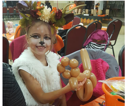
Free Face Painting and Balloon Animals are a blast