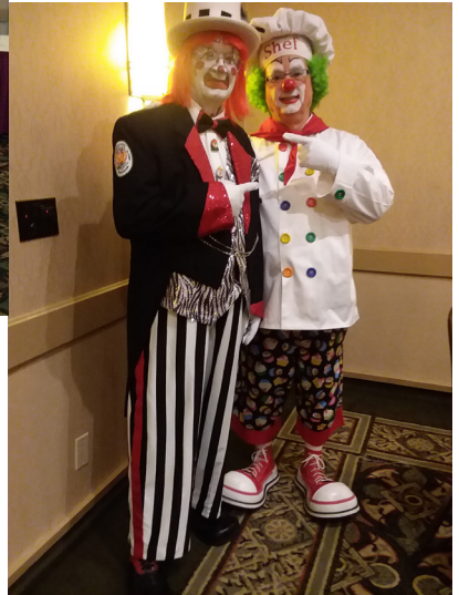
T-Kat takes 2nd Place in clown competition