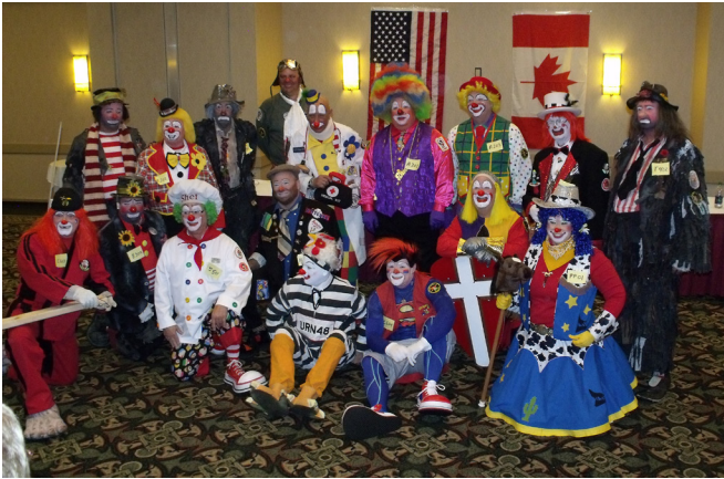
Clown competition at G.L.S.A.