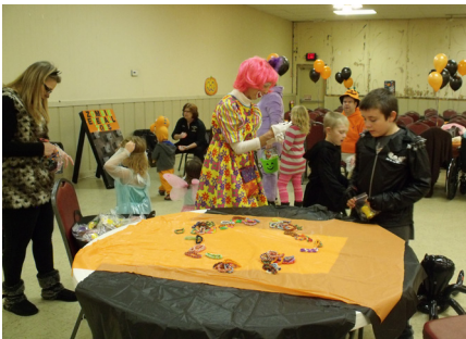
Kids enjoy the games