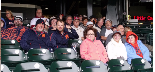
Birds of a feather...