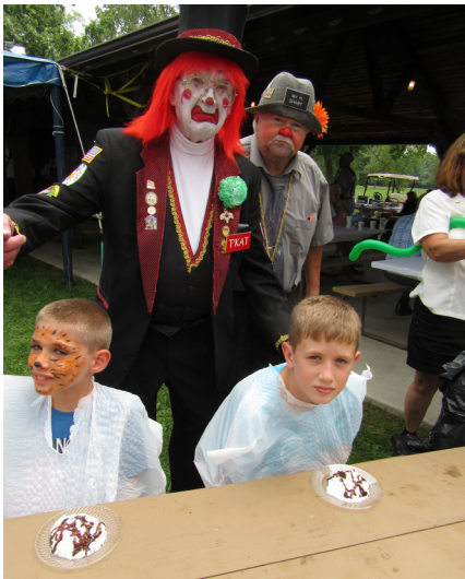
Annual Pie Eating Contest