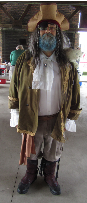
Shrine Clown "Blue Beard"