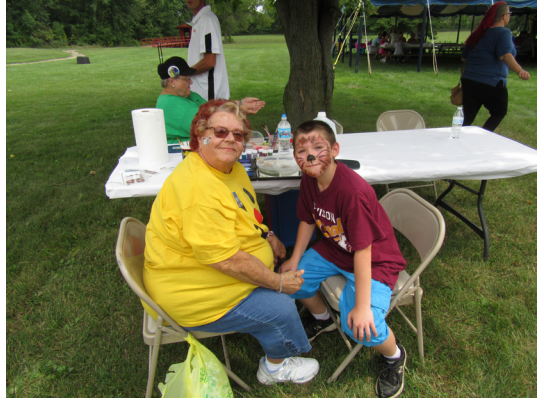
Face Painting by Le Dias Clowns