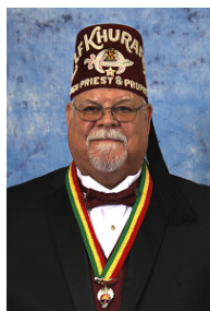
High Priest & Prophet