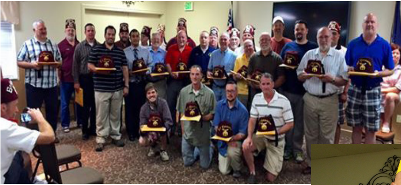
17 NEW SHRINERS AND THEIR 1ST LINE SIGNERS