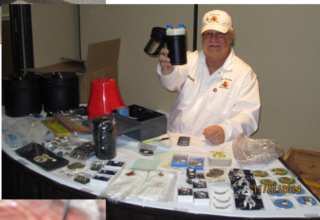
Selling Shrine Paraphernalia