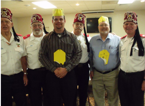
Au Sable Shrine Club with Their Candidates