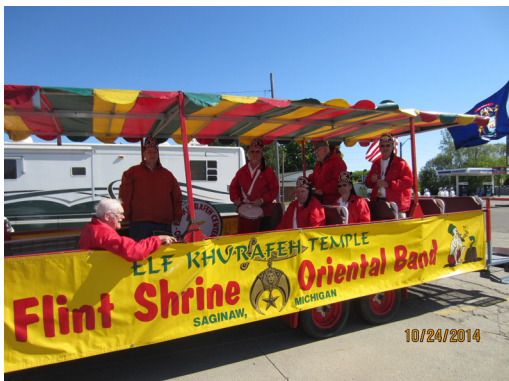
Oriental Band in Parade at W. Branch Ceremonial