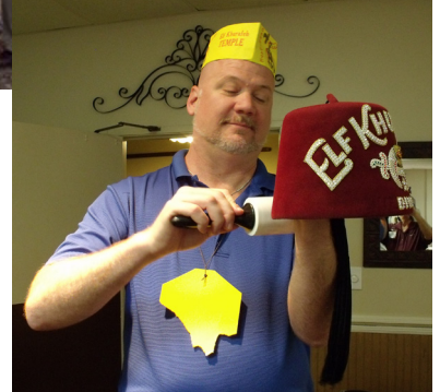
New Fez Cleaner