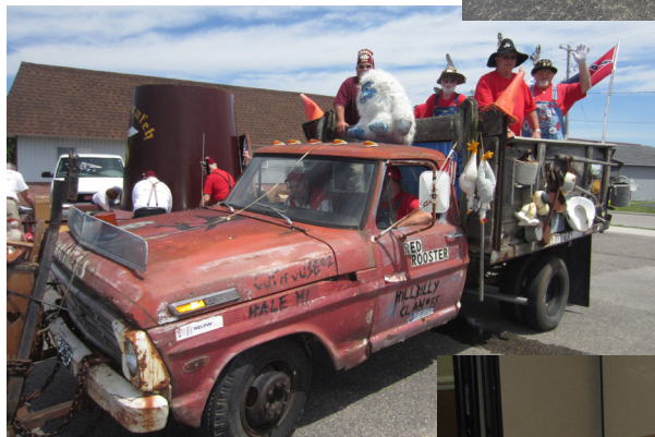
Hillbillies in Parade