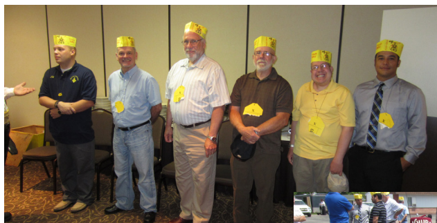
Candidates standing by