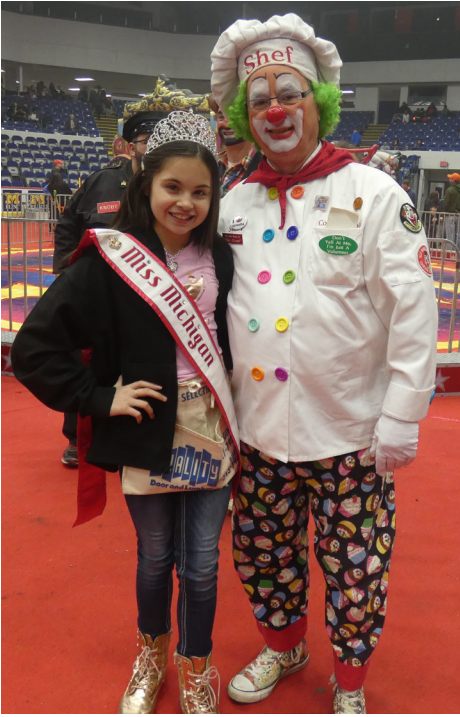
Miss Michigan attends the Shrine Circus