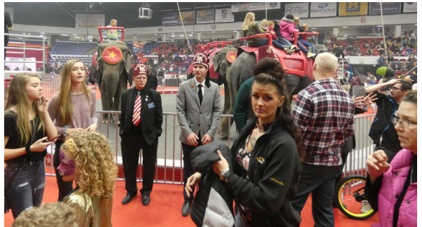
Elephant Rides are a big attraction