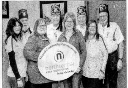
Staff of the North Central Area Federal Credit Union in Standish pose with members of the local White Pine Shrine Club after presenting a $900 donation to them Jan. 11. Donations from businesses are one way the Shriners receive funds for Shriners Hospitals.