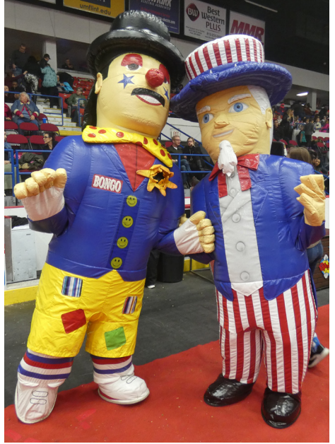
Bongo and Uncle Sam