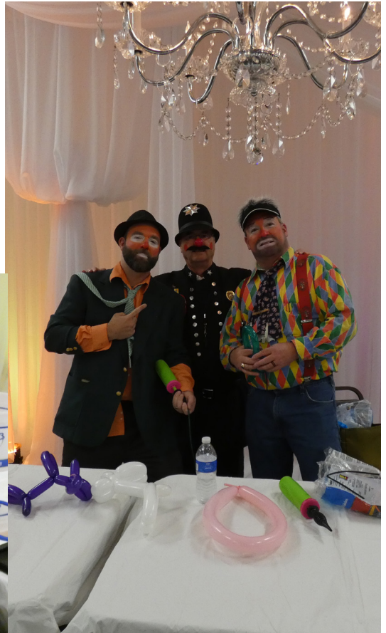
Clowns making Balloon Animals for the kids.