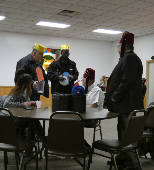
The candidates selling tickets. Breaking them in right.