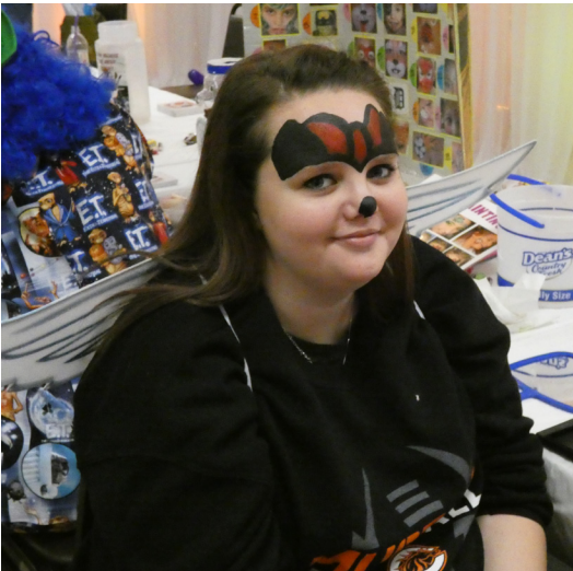
Face Painting is always a big hit for kids of all ages.