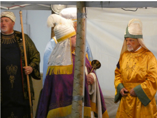
Ritualistic Cast at work.