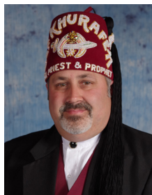
High Priest & Prophet