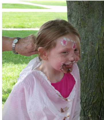
Pie Eating contest; great fun for the kids.