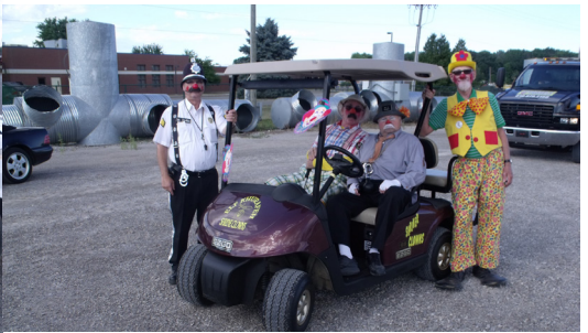
Sarge, Blooper, Frizy, and Shabby....The Clown Unit