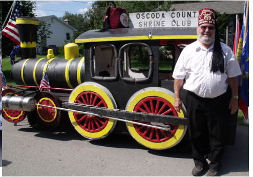
Oscoda Shrine Club