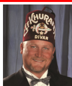
1st Ceremonial Master