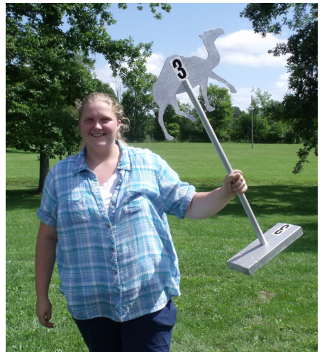
The Camel Races returned to the FAMILY PICNIC this year. It was not a huge success but the kids and adult participants had a good time. Maybe the Oriental Band will try again next year.