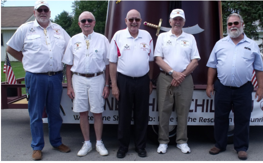
White Pine Shrine Club