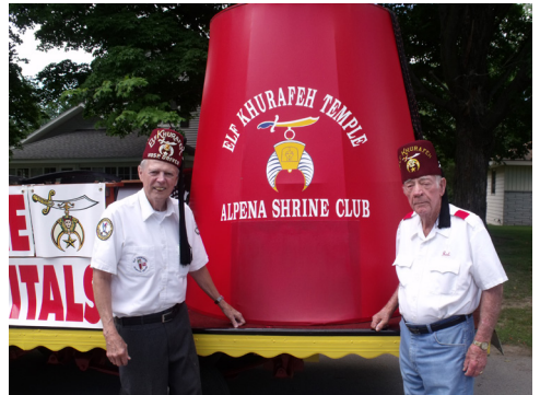
Alpena Shrine Club