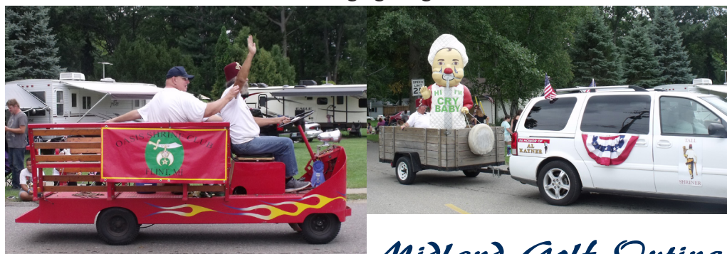
Oasis Shrine Club