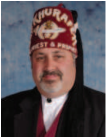
High Priest & Prophet