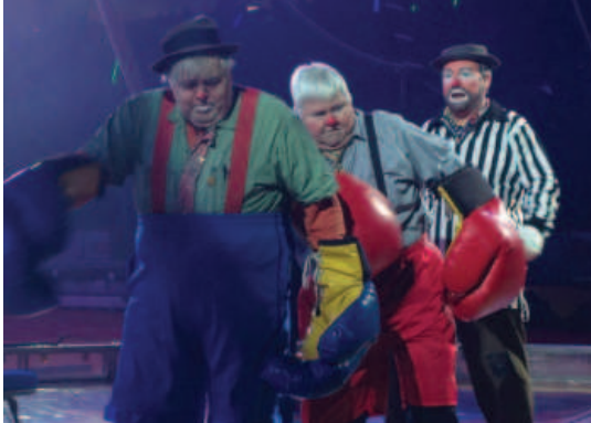
The Flint Shrine Circus is under way and as usual the clowns have come up with some very funny skits. Pictured above are Boxer Rags, Boxer Shaby, and Referee Ashes.