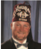
1st Ceremonial Master