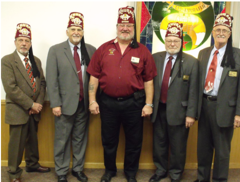
Some Past Potentates