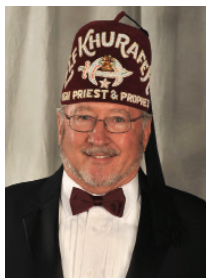
High Priest & Prophet