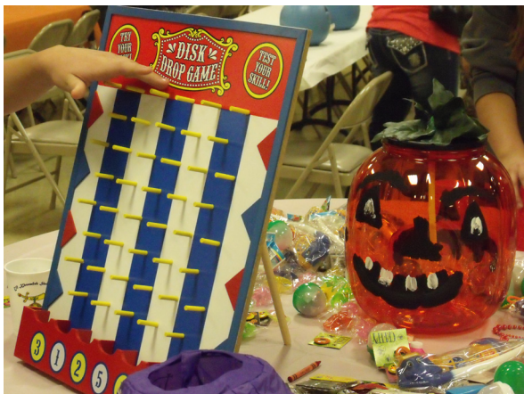
Games and prizes for the kids to play