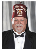
Captain of the Guard

tinknocker521@gmail.com 12025 E. Richfield Rd. Davison, MI 48423 Ph# 810-397-4328