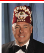
1st Ceremonial Master