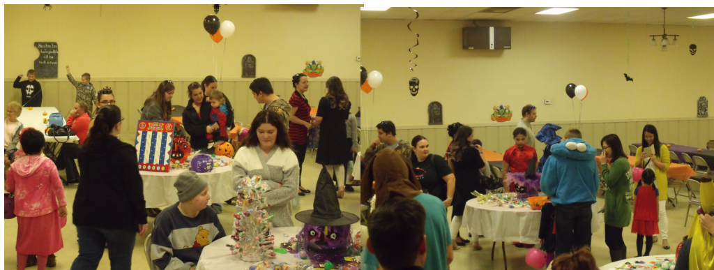
Kids and more kids having fun