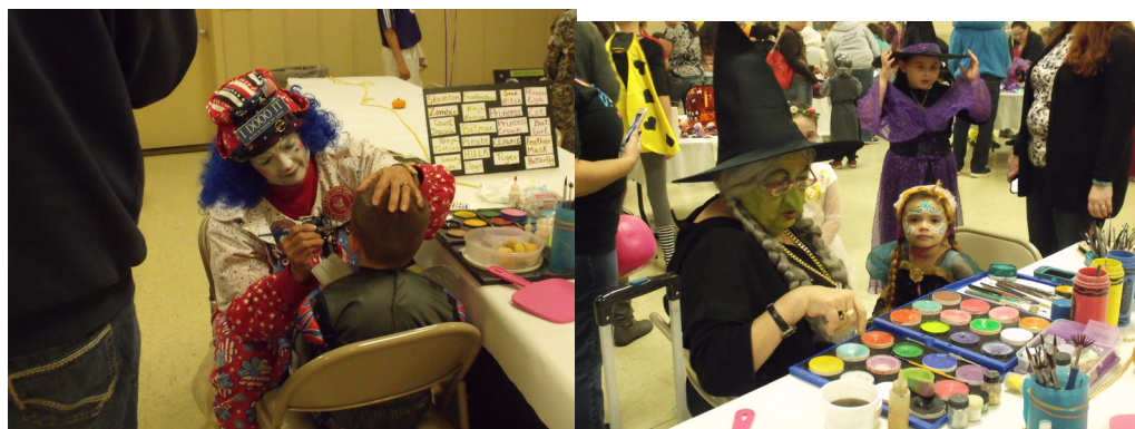
Kids love to have their faces painted