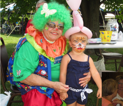
Face Painting by LeDias Clowns of El Said Court