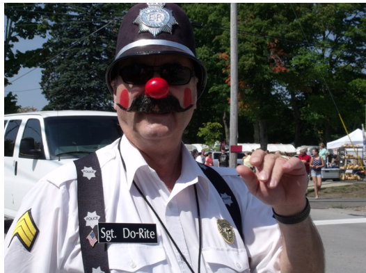
Sarge was on duty!