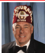
1st Ceremonial Master